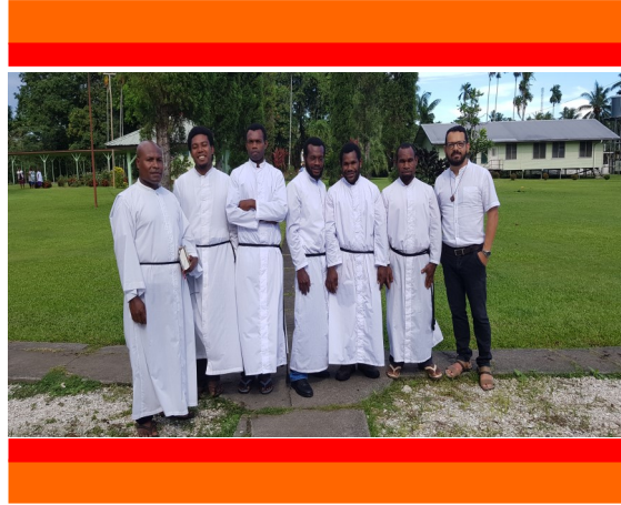
POS-NOVITIATE FOR BROTHERS