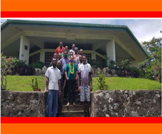
PÓS-NOVITIATE FOR PRIESTS