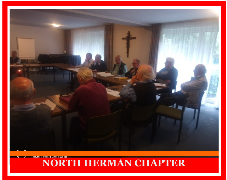
NORTH HERMAN CHAPTER