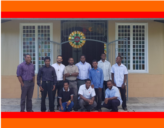
PRE-NOVICES AND NOVICES