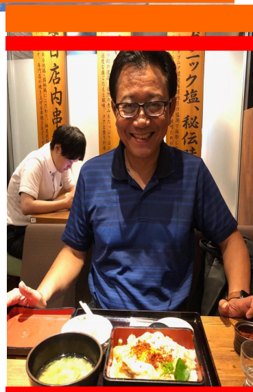
Priyo Superior of Japan